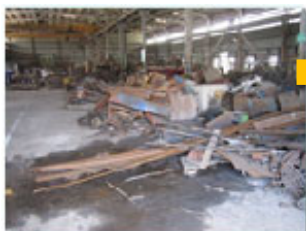
Prior to improvement