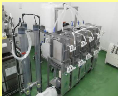
Film separation machine